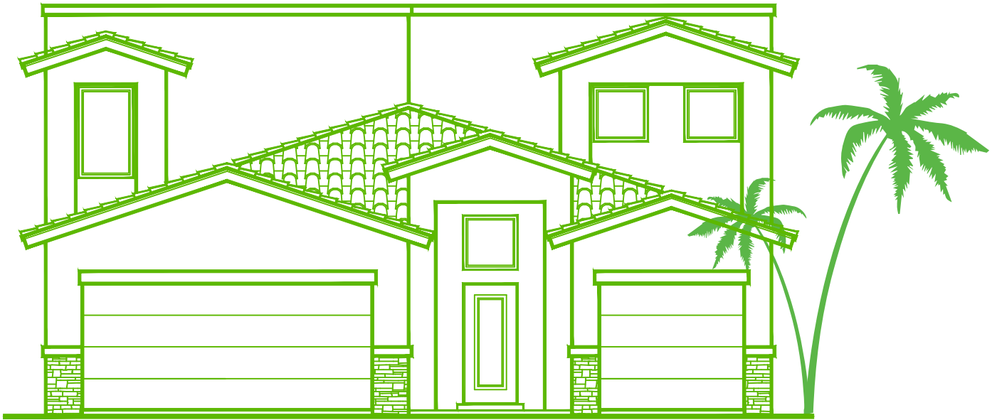
Flat with clay tile