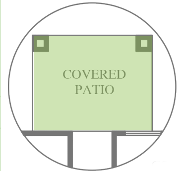
COVERED PATIO UPGRADE 10'W x 8'D