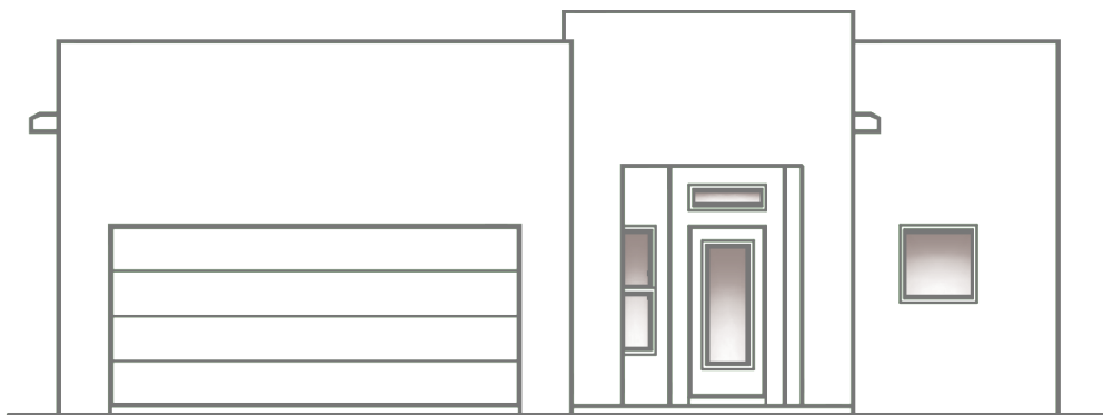
ACACIA - B