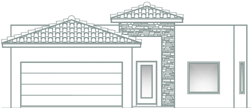
Flat with clay tile