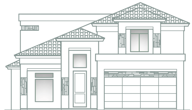
Flat with clay tile